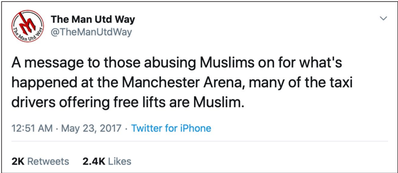
Figure 8. Content shared by @TheManUtdWay http://Twitter.com/TheManUtdWay/statuses/866803692644782080 .