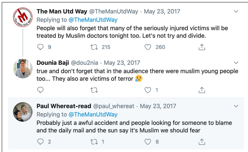
Figure 9. Example response to content shared by @TheManUtdWay http://Twitter.com/TheManUtdWay/statuses/866803692644782080 .

violence, or banal social actors who are first responders, but also victims of violence overtly perpetrated in the name of their religion.