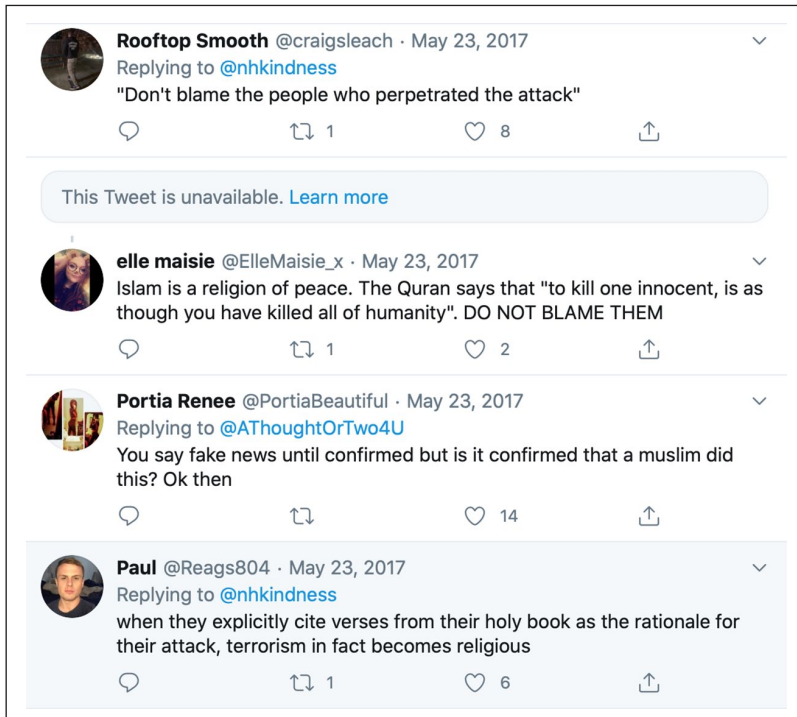
Figure 5. Example response to content shared by @nhkindness http://Twitter.com/nhkindness/statuses/866879413236924417 .