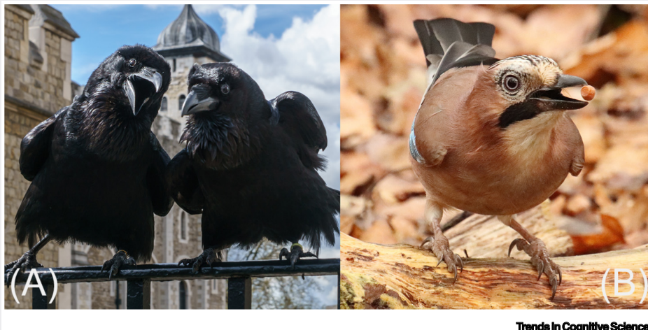
Figure 1. Two Corvid Species Commonly Used in Comparative Cognition Research. (A) Ravens © User: Colin/Wikimedia Commons/CC BY-SA 4.0; (B) Eurasian jay © Mrs Airwolfhound/Flickr/CC BY-ND 2.0.

Selfhood: magpies have passed the mirror-mark test [69]. There is also evidence that corvids recognise that they have different perspectives/desires from others. For example, jays use information from their own experience as a pilferer to make inferences about opportunities for theft by others [74]. Male Eurasian jays (Figure 1B) feed their female partner the food she would like to eat, adapting to her changing desires [92]. Further research is required to explore the link between these abilities and self-consciousness.