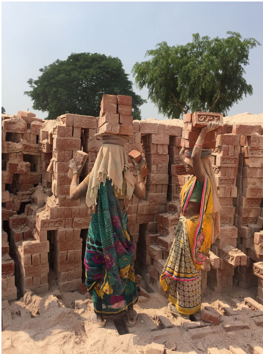
FIGURE 1 Adivasi seasonal migrant labour from Jharkhand head loading cooked bricks at a factory in Uttar Pradesh.

Some intra-caste differences must be noted. First, in line with other studies and all India figures, while labouring conditions were universally poor – all went into indecent informal sector work – there was a qualitative difference between the work Adivasis and Dalits could get (in the absolute pit of the labour hierarchy) and that which OBCs and Muslims attained (marginally better work) (see also, e.g., Jain & Sharma, 2019; Srivastava, 2019). The latter considered the work and the accompanying living conditions of Adivasis and Dalits low status and, though only marginally better off themselves, were usually paid monthly rates (rather than piece rates), which in theory guaranteed some monthly income, had slightly better