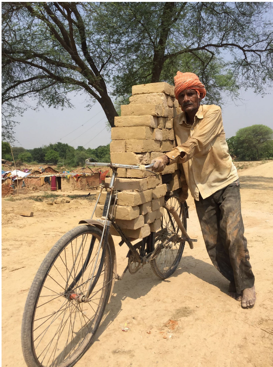
FIGURE 2 Adivasi seasonal migrant labour from Jharkhand carting uncooked bricks at a factory in Uttar Pradesh.

These qualitative differences are conjoined with strong spatial geopolitical dynamics of the political economy of seasonal labour migration. Regions that have experienced a long history of internal colonialism, with outsiders siphoning off