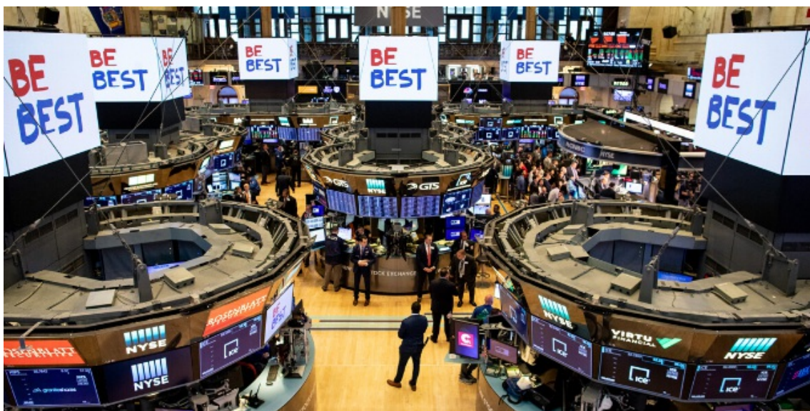
Image of the New York Stock Exchange, taken as part of a visit by Melania Trump, 23 September 2019.