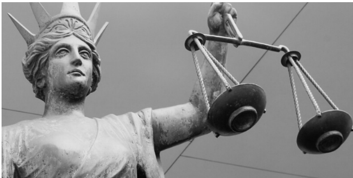
Scales of Justice, Brisbane Courts

The bulk of the book is made up of critical commentaries on political events and intellectual debates that shaped political liberalism in the US and Britain in the post-war era. There are several powerful arguments animating the eight chapters of Forrester's book. In an introductory spirit, Chapter One turns to the question of the making of justice theory and frames the wider analytical project. Following up on the problem of justification, Forrester subsequently discusses ideas about obligation and civil disobedience (2) and those of war and responsibility (3). In Chapter Four the author grapples with some of the attempts to reconstruct and rethink Rawls's framework, before focusing in more detail on accounts of global justice in the context of decolonisation in Chapter Five. Turning to the problem of the future (6) and the New Right and New Left (7), Forrester brings into conversation liberal egalitarianism with concepts of markets, choice and responsibility. In Chapter Eight, she conclusively shifts attention to the limitations of political philosophy and makes a strong point for questioning the currency of liberal thought to understand the times in which we live.