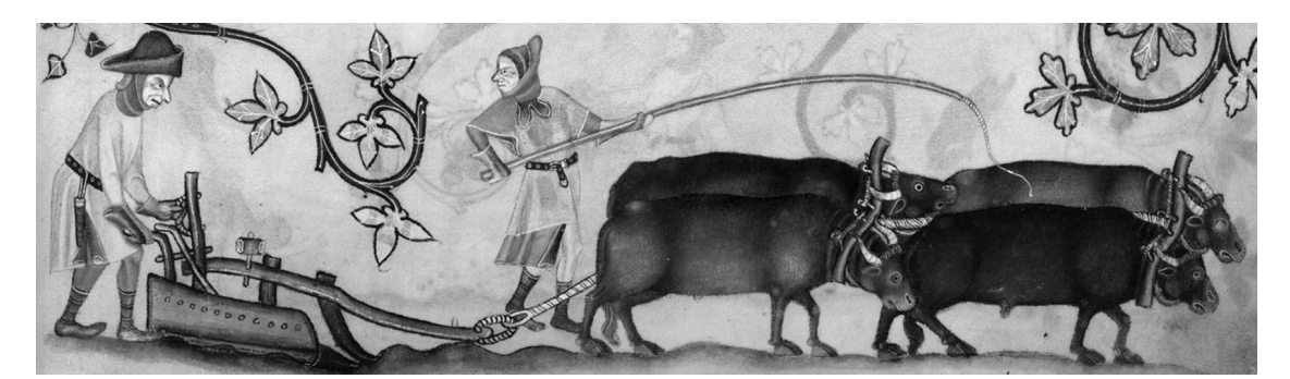
FIGURE 3: Luttrell Psalter ploughing scene (© The British Library Board Add. MS 42130, fo. 170)

second-tier ranks,<sup>25</sup> but carters were almost always first-tier members in the famuli workforce. In contrast, shepherds ( bercarii : 346, or 9.2 per cent, of the 3748 total) were arranged much more by status and experience, as seen in the Peterborough Abbey manor of (North) Collingham, Nottinghamshire, in 1300–01, with a 'shepherd', 'second shepherd', 'third shepherd', and a 'boy shepherd' ( garcio bercarius ) being recorded. The first three were all given a 'full livery', which, for this manor, required each of them to work ten weeks to receive a quarter of mixed grains (mostly rye plus grains received from the manorial windmill), while the garcio bercarius was given a 'half livery' requiring 20 weeks work per quarter.<sup>26</sup> Indeed, as we shall see again below in a fuller assessment of the total 'sheep carer' population, many working with sheep were not labelled specifically as 'shepherds' (that is, the bercarii represented in Figure 2), but rather as 'keepers' ( custodes ), being responsible for particular segments of the manorial flocks, such as the ewes, 'hoggs' ( hoggastri ; young castrated males), lambs, and sometimes even rams.