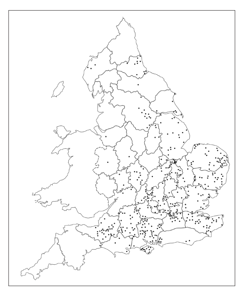
MAP 1: Location of demesnes in account sample, c .1300.