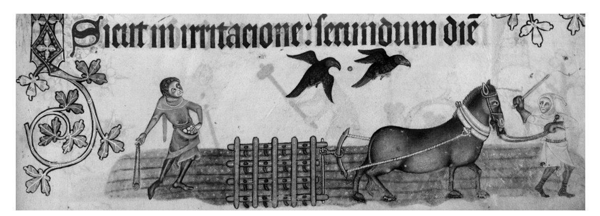
FIGURE 4: Luttrell Psalter scaring crows and harrowing scene (© The British Library Board Add. MS 42130, fo. 171)

Of these, 14 were designated as garciones . Where the rate of grain payment was indicated – in eight of these 14 cases – six of these garcio bird-scarers had to work 16 weeks for their quarter of grain, one for 18 weeks, and one for 32 weeks. Three of the remaining 12 cases of bird-scaring, but where the person was not styled as a garcio , also had to work 16 weeks for their quarter of grain. How old might these bird-scarers have been? Jane Humphries, in her recent book on child labour during the Industrial Revolution, gives several examples of bird-scaring (of crows or rooks usually) as the first job that young people were given in an agricultural setting. Of the 22 or more instances of crow-scarers Humphries found in her sample of diaries from the period,<sup>64</sup> the ages of three of them when they started crow-scaring are recorded in her text as 'nine', 'not yet six', and 'from age six'.<sup>65</sup> A fourth and particularly illuminating example was that of William Arnold, born in 1860, whose first job was 'scaring crows from newly sown fields in late February and early March', before he went on to guard 100 sheep, lead the first horse of the wagon and mind 40 pigs during the acorn season, all before he went into the boot trade 'aged just over seven'.<sup>66</sup>