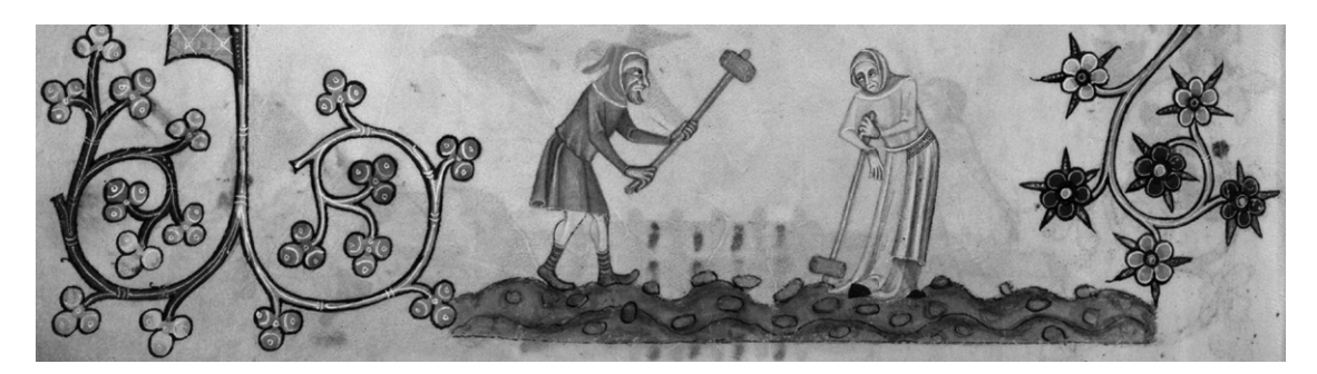
FIGURE 5: Luttrell Psalter spreading furrows scene (© The British Library Board Add. MS 42130, fo. 171v)