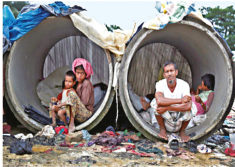
Distressed Rohingya have taken shelter inside large unused sewer pipes at a camp in Cox's Bazar.