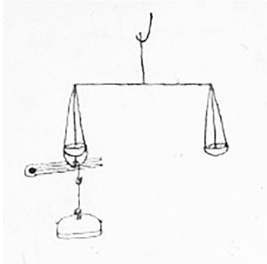
Fig. 2 Harriot's drawing of a hydrostatic balance. ©British Library Board BL Add MS 6788 f.233r

The last of this batch of folios is 6788/231r , which contains a sketch of an equal-arm balance, clearly modified for weighing objects in air and in water (Fig. 2). This instrument closely resembles the hydrostatic balances of later times.